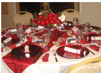
Decorated table from yesterday (that would be last year!)

"You have the right to live without fear or humiliation."