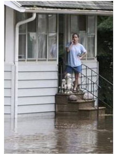
Flooding in Cedar Rapids, Iowa in July, 2008, displaced women at a disproportionate rate.

$20,000 to Cedar Rapids, Iowa to restore a homeless shelter for women destroyed by floods.