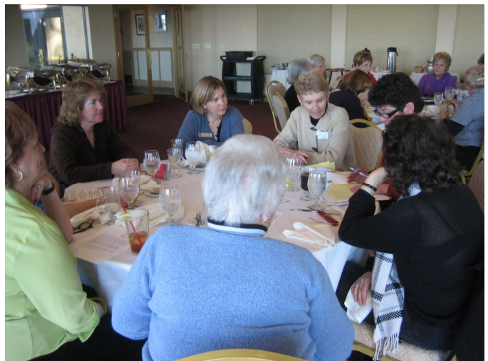
Ways and Means committee members meet to put the final touches on the Celebrity Waiter fundraiser.